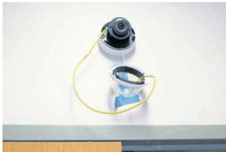
In this July 10, 2018, file photo, a camera with facial recognition capabilities hangs from a wall while being installed at Lockport High School in Lockport, N.Y.

later that year. The western New York district was among the first in the country to incorporate the technology in the aftermath of deadly